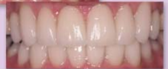
Worn teeth before & after