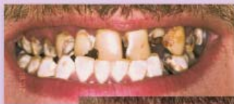
Decayed teeth before & after

Call us today at 926-5445 to make an appointment for a Free Cosmetic Consultation or log onto our web site and view our Smile Gallery at www.smilesbyarnold.com .